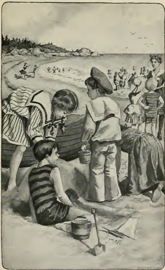
“The little people played in the sand or paddled in the sea.” Page 134.